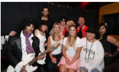
2017 Lip Sync Battle Boca Raton