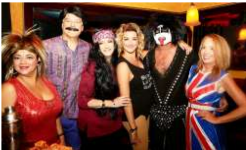
2015 Lip Sync Battle Boca Raton