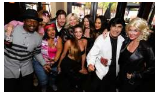
2017 Lip Sync Battle West Palm Beach

Nat King Cole Generation Hope, Inc. 498 Crawford Boulevard Boca Raton, Florida 33432 natkingcolegenerationhope.org - ssjohn@natkingcolegenerationhope.org