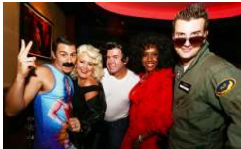
2016 Lip Sync Battle Ft Lauderdale