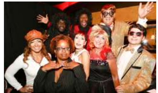
2016 Lip Sync Battle Boca Raton